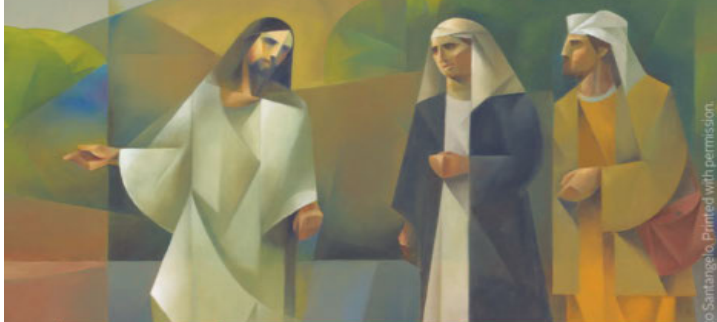
Painted with permission.