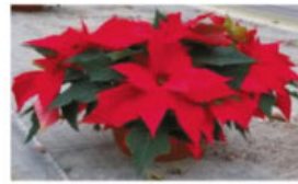
Centerpiece (low foliage $30)