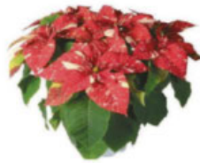
Superba Glitter Poinsettia

Please support the youth of St. Paul VI Parish by purchasing poinsettias to decorate your home or business or to give to friends!