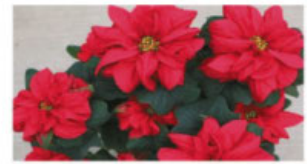
Winter Rose Red Poinsettia

Please make checks payable to St. Paul VI Parish. All orders are due by Monday, November 20. Plants will be available for pickup on December 14 & 15 at the Lyne Center.