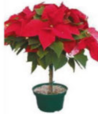
Poinsettia Tree ($40)